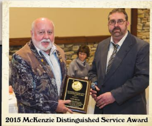
2015 McKenzie Distinguished Service Award